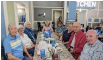
lunch & leisure on Aug. 16