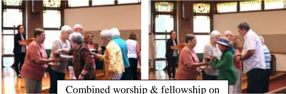
Combined worship & fellowship on Aug. 11th