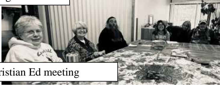
Christian Ed meeting

Church Leadership elected at our Church Conference in December are looking forward to 2025