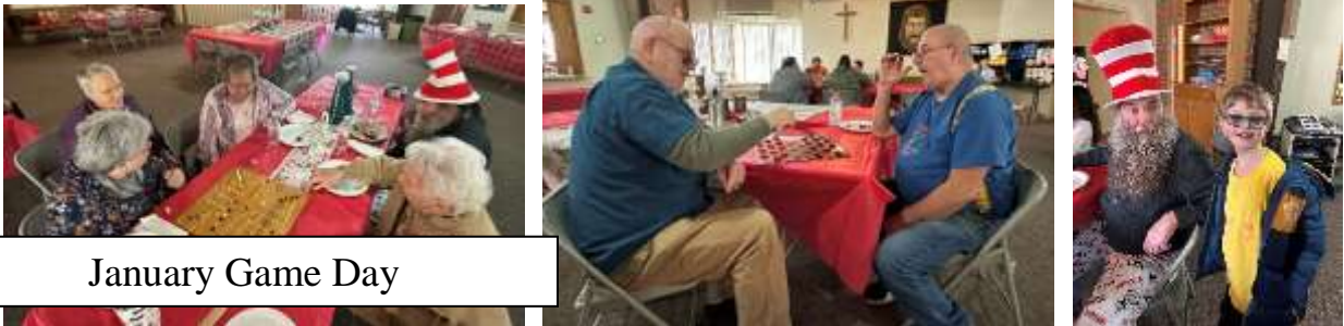
January Game Day