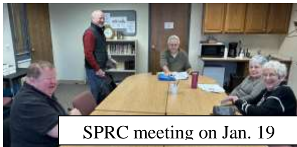
SPRC meeting on Jan. 19