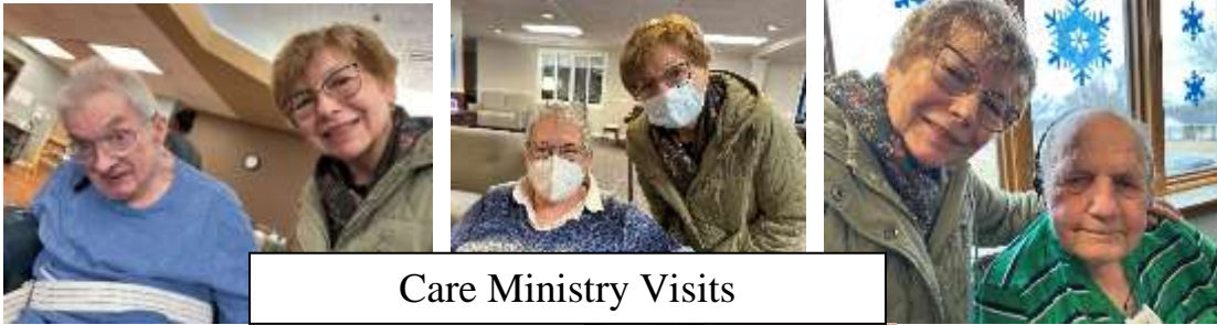
Care Ministry Visits