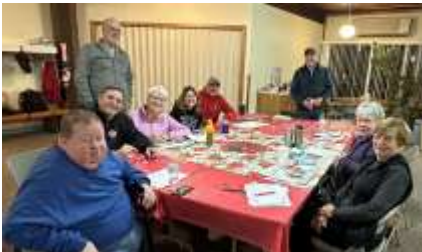
Church council meeting on Jan. 13