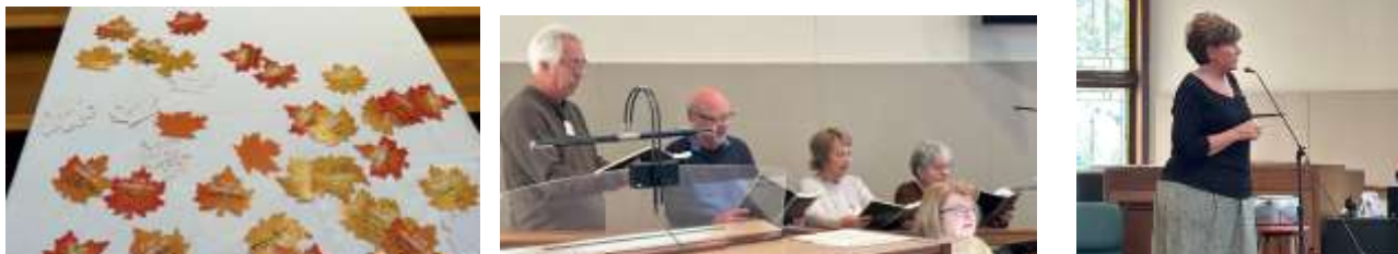
Stewardship, Music, Bible Study, Revival, Guest Preaching