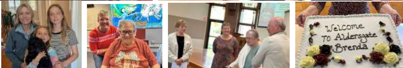
New and Returning