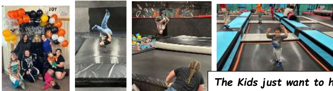
The Kids just want to have fun!!