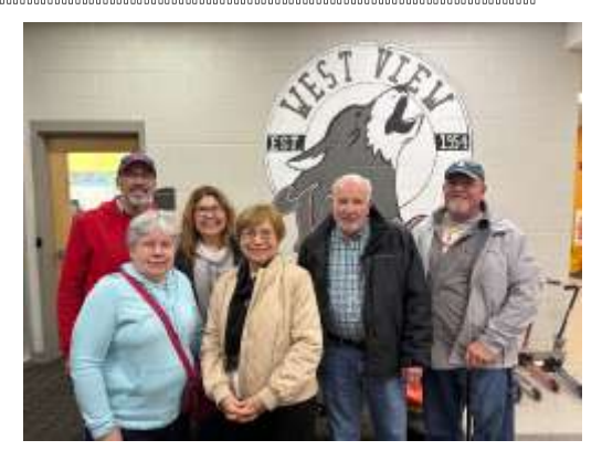
Aldersgate volunteers for Westview Stem event